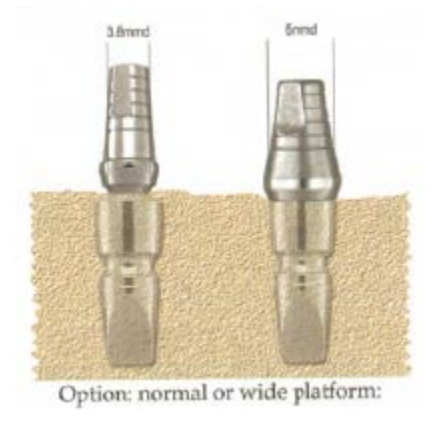
Ex. 1008, 29. The above image shows both the normal and wide platform abutment options for the SPI implant. The ABT Catalog states that "[i]t is

We are unpersuaded by this argument. As discussed above, we do not construe "coronal region" to exclude mating bevels. Nor do we construe the claims to impose a functional requirement that the coronal region must allow for bone to relapse. Furthermore, the "wide platform" abutment that the bevel is designed to mate with is only one option for the 5 mm SPI implant. The ABT Catalog indicates that a "normal platform" abutment may be used instead, as shown in the image below: